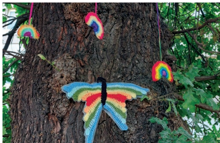
A Knitting Norbury Together Installation